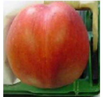
FRESH `N` SMART PACKAGING